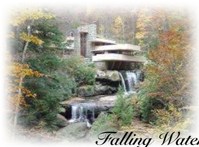
Falling Water (Famous Architecture Building)

Granite School District is committed to providing educational and employment opportunities to students without regard to race, color, sex, religion, age, national origin or disability in accordance with Title VI of the Civil Rights Act of 1964, Title IX of the Educational Amendment of 1972, Section 504 of the Rehabilitation Act of 1973, the Age Discrimination Act of 1975, and the Americans with Disabilities Act.