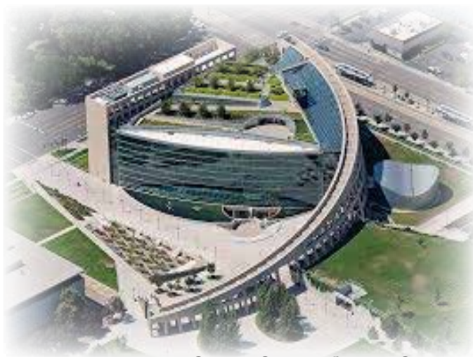
Salt Lake City Library