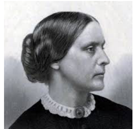
Susan B. Anthony

As an educator and a champion of self-help, he tried to lead black America up from slavery.