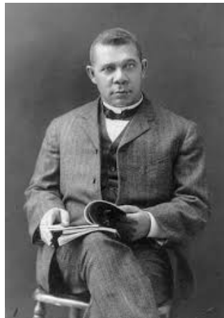
Booker T. Washington

The author of the five most important words in American history: "All men are created equal."