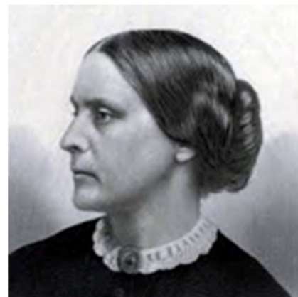
Susan B. Anthony

As an educator and a champion of self-help, he led black America forward from slavery.