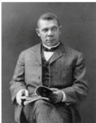
Booker T. Washington

The author of the five most important words in American history: “All men are created equal.”