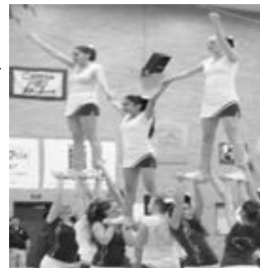
The cheerleaders performed in the gym for all of the students.

required to wear yellow, juniors wore green, and Seniors had to wear white. On Friday students gathered in the gym to compete against other classes.