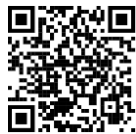
Book Fair E-Wallet